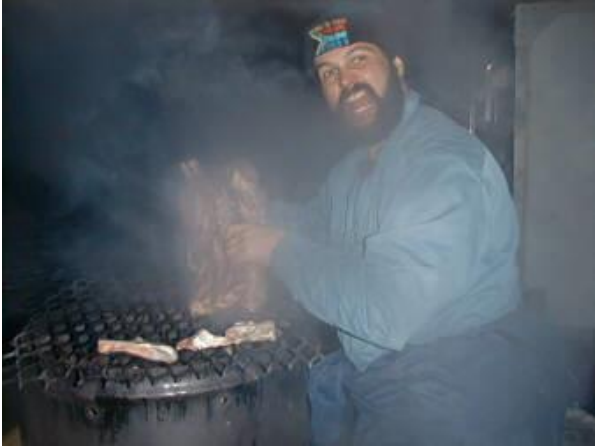
Dr. Vleisbraai gepla deur die maan!

Winderige Sondag evac ons terug, maar gaan speel eers vir 'n ruk op Schumacher en ry sy 'supertube'. Uiteindelik met rittel, hop, spring en stamp-stamp, kom ons almal veilig terug na die groot huis op die berg.”