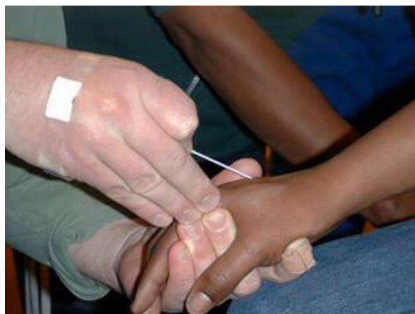
Pushing the needle in...