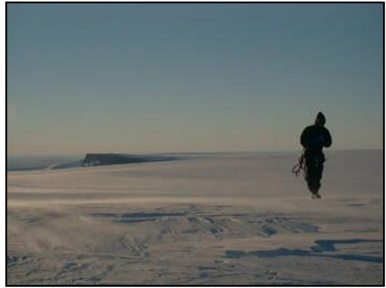
Vesles in the distance...

Firstly there is the normal clothing you are already wearing. That stays on. (Except shoes of course.) Then comes the thick blue standard issue socks.