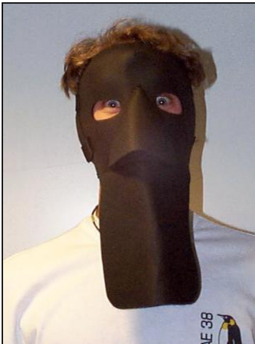
The Rubber Mask.

The last item on the list of clothes is of course gloves, of which we normally wear two pairs at the same time: Woolen gloves inside and leather gloves over them.